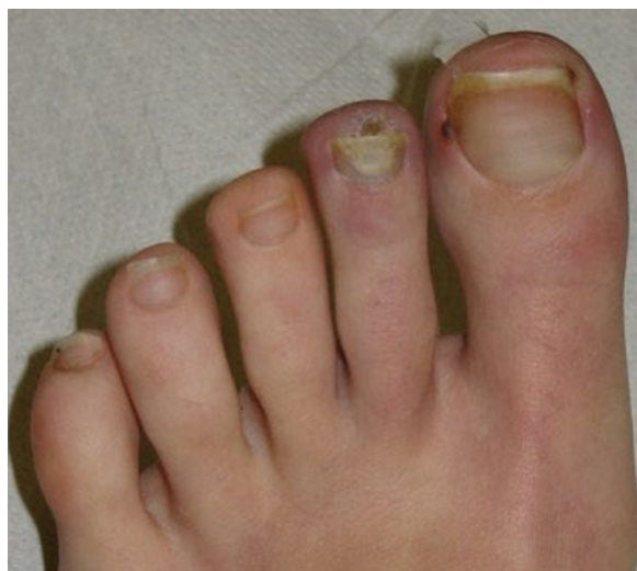
Figure 2 Toes as they appear after 5 sessions of HBO.

Vasculitic skin ulcers are a manifestation of muscular-vessel vasculitis, and are very painful and difficult to manage. They are usually treated by medical therapy with systemic anti-inflammatory drugs, steroids and immunosuppressants. For the treatment of refractory vasculitic skin ulcers the use of prednisone combined with other drugs such as methotrexate, azathioprine, mycophenolate mofetil, cyclophosphamide or hydroxychloroquine is recommended. Even the administration