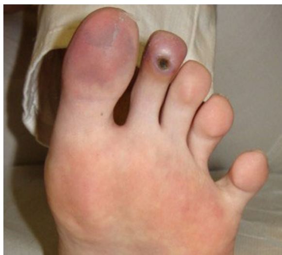
Figure 1 Ulcer as it appears after 5 sessions of HBO.

patient, blood tests were normal and there have been no new flares of the disease so far.