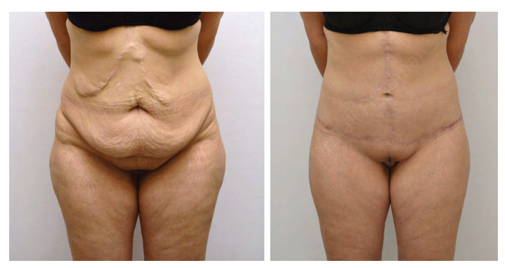
Fig. 3. This is a 38-year-old patient, who had a few abdominal surgeries due to a motor vehicle accident. She was an active smoker who did not stop smoking before surgery. She underwent 1 HBOT session the morning of fleur-de-lis lower body lift and had an uneventful surgery and recovery.