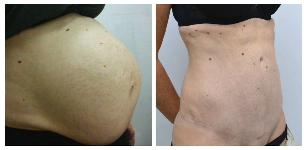
Fig. 2. A 34-year-old patient, status postmultiple cesarean sections including 2 pairs of twins. She had severe diastasis recti and expected to have a wide undermining as part of her abdominoplasty. She was an active smoker. She underwent 1 HBOT session the morning of abdominoplasty and had an uneventful surgery.